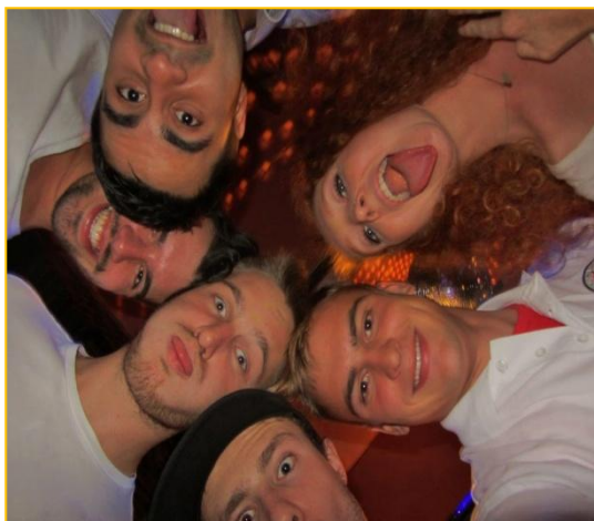
Fun evenings with your new classmates.

BOWLING NIGHT Join us for a fun-filled evening of team building activities. You show up, we make the night a great one! Come and show us your bowling skills, and get acquainted with your new colleagues and with the upper year students.