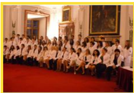
The celebration takes place in the Profesní Dům Hall.

WHITE COAT CEREMONY After a very successful initiation, the 2 nd Medical Faculty is hosting the White Coat Ceremony for the 6 th time in the history of Charles University. This ceremony represents the first year medical student's introduction into the medical society. Speeches will be given by the Dean and some faculty members. Individually, each student's name will be called and you will receive your first university white coat personally from the Dean of the faculty. Along with your peers, you will then recite an oath pledging your sincerity to your future profession.