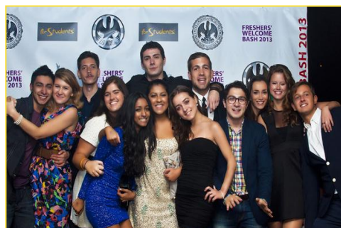
Medical Mashup Party

PRAGUE BY NIGHT and MEDICAL PARTY As it has been for the past few years, the 1 st , 2 nd and 3 rd medical faculties are teaming up to give you all the best opportunity to meet and greet fellow medical freshers and senior students from all over the world. The evening promises great people, great music, and a great atmosphere. Special student discounts on all your favourite drinks will be available throughout the night, so come along and party the night away!