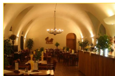
The deluxe dinner will be enjoyed in a splendid environment.

All freshers' week activities and materials are offered to you by the Dean of the Faculty, including the University White Coats and the Czech book.