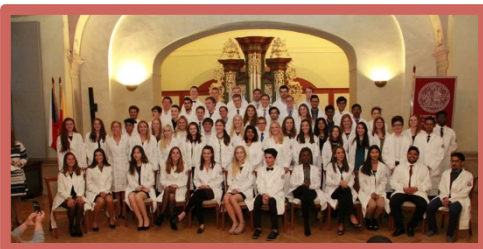
The celebration takes place in the Profesní dům Hall.