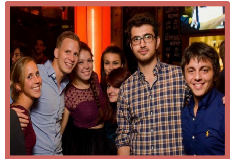
Medical Mashup Party

INTER-FACULTY MEDICAL PARTY As it has been for the past few years, the 1 st , 2 nd and 3 rd medical faculties are teaming up to give you all the best opportunity to meet and greet fellow medical freshers and senior students from all over the world. The evening promises great people, great music, and a great atmosphere. Special student discounts on all your favourite drinks will be available throughout the night, so come along and party the night away!