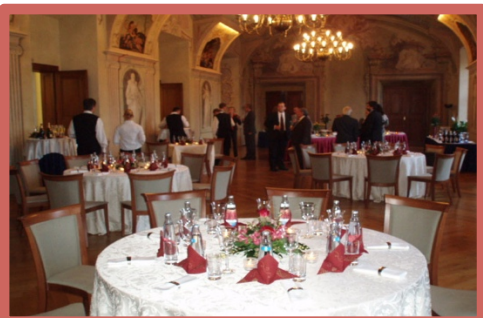
The deluxe dinner will be enjoyed in a splendid environment.

WHITE COAT CEREMONY After a very successful initiation, the 2 nd Medical Faculty is hosting the White Coat Ceremony for the 8 th time in the history of Charles University. This ceremony represents the first year medical students' introduction into the medical society. Speeches will be given by the Dean and some faculty members. Individually, each student's name will be called and you will receive your first university white coat personally from the Dean of the faculty. Along with your peers, you will then recite an oath pledging your sincerity to your future profession.