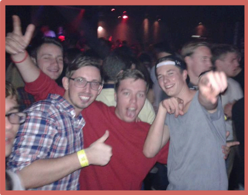
Fun evenings with your new classmates.

TEAM BUILDING Join us for a fun-filled evening of team building activities. You show up, we make the night a great one! Come and show us your skills, and get acquainted with your new colleagues and with the upper year students.