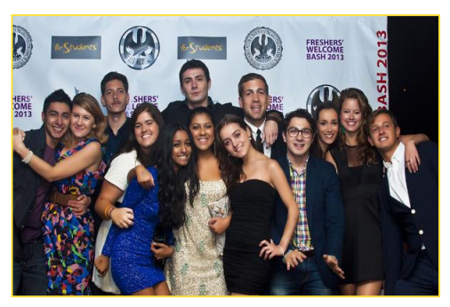
Medical Mashup Party

PRAGUE BY NIGHT and MEDICAL PARTY For the 4<sup>th</sup> time in a row, 1<sup>st</sup>, 2<sup>nd</sup> and 3<sup>rd</sup> medical faculties are teaming up to give you all the best opportunity to meet and greet fellow medical freshers and senior students from all over the world. The evening promises great people, great music, and a great atmosphere. Special student discounts on all your favourite drinks will be available throughout the night, so come along and party the night away!